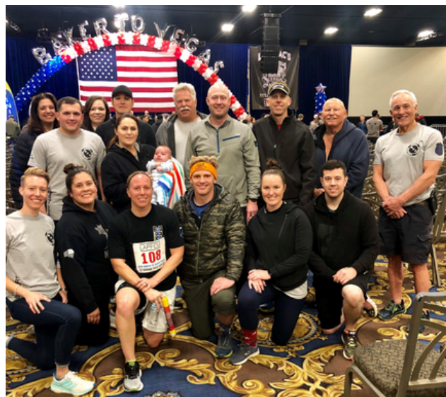
Pictured above are several runners and support staff members of the 2019 Burbank Police B2V Team, shortly after crossing the finish line.

The Burbank Police Baker 2 Vegas Team would like to thank everyone who supported this year's race effort, including the Burbank Police Command Staff, Burbank Police Officers' Association, support staff and volunteers, those who picked up extra shifts to allow officers to participate, and community members who donated to support the team's participation.