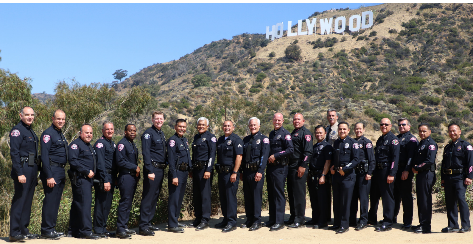
Police Chiefs of Los Angeles County gather in front of the Hollywood sign wearing pink shoulder patches in support of breast cancer awareness.