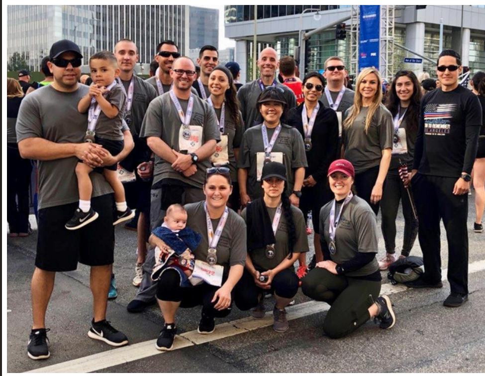
Both sworn and civilian Burbank Police employees participated in the Run to Remember 5K, 10K and half-marathon

Participants of this year's race would like to thank the Burbank Police Officers' Association for their generous contribution towards entry fees.