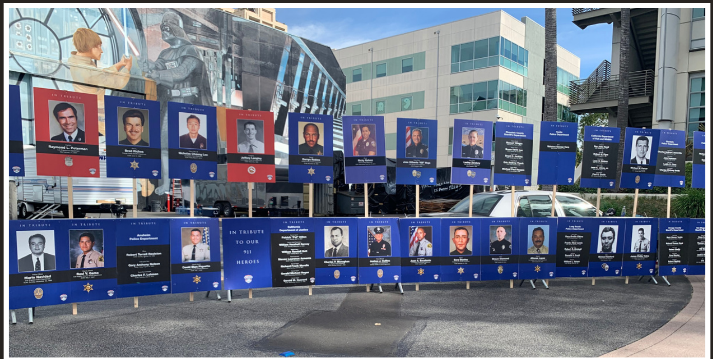
Banners depict the photos and names of fallen first responders along the Run to Remember route.