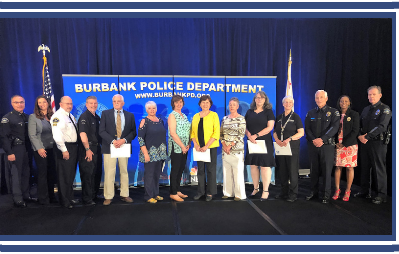
Several Burbank Police Volunteers were honored. Volunteers collectively donated nearly 4,000 hours in 2018.