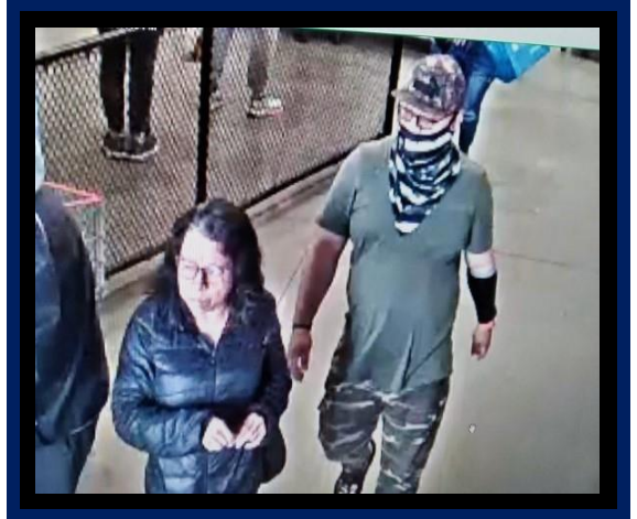
Still images from three separate incidents.