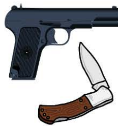
FIREARMS, KNIVES, & WEAPONS