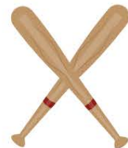
BASEBALL & SOFTBALL BATS