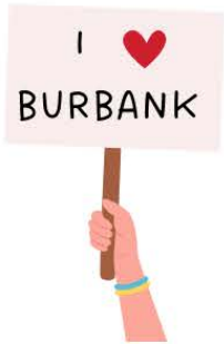
SIGNS & POSTERS