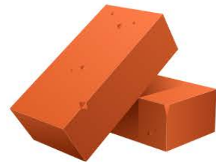
BRICKS & ROCKS