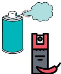
AEROSOL SPRAYS & PEPPER SPRAYS